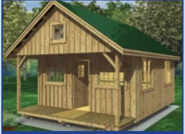
Option C Gable Porch

Visit www.JamaicaCottageShop.com/16x20vc.asp for more details