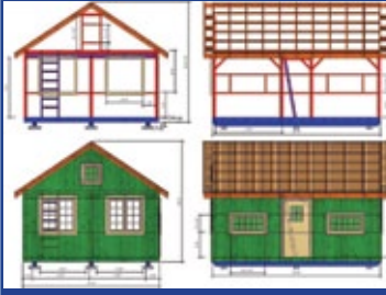
Option B No Porch