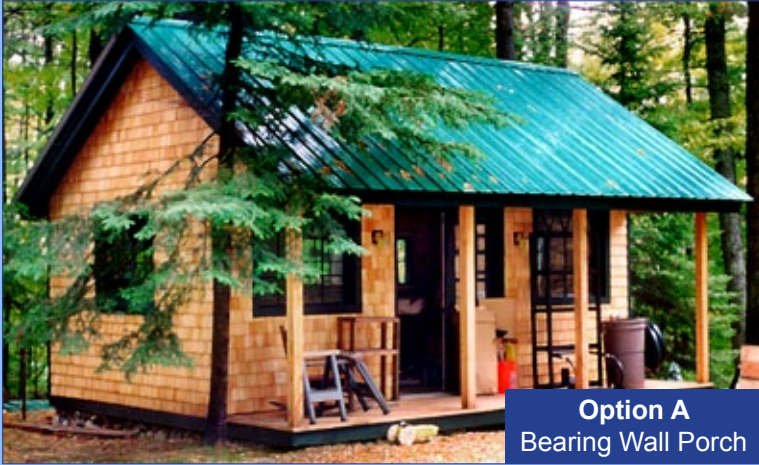
Option A Bearing Wall Porch

Recommended Foundation: 18'x22' pad compacted crushed stone 8-12" deep