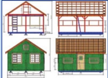
Option B No Porch

Visit www.JamaicaCottageShop.com/16x20vc.asp for more details