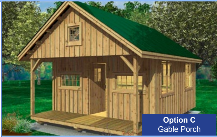
Option C Gable Porch