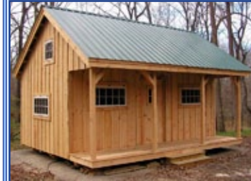
Option A Bearing Wall Porch